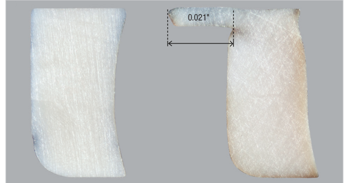
PEEK before test (left), and after test (right)

Arlon® 3000 XT has an elongation at least three times higher than filled PEEK, as well as providing superior creep and extrusion resistance.