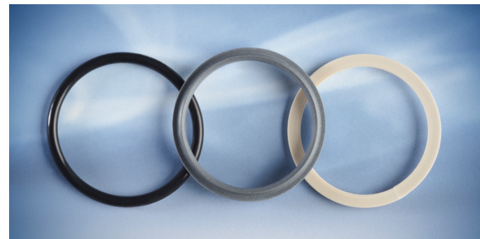
Low friction, pressure relieving, unidirectional dynamic seal for use in tandem or single rod seal arrangements