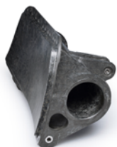
Structural Air Flow Doors