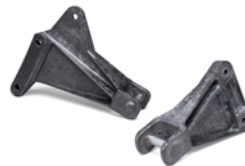
Brackets & Fittings