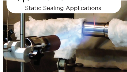
Greene Tweed Testing of FPH Seal™