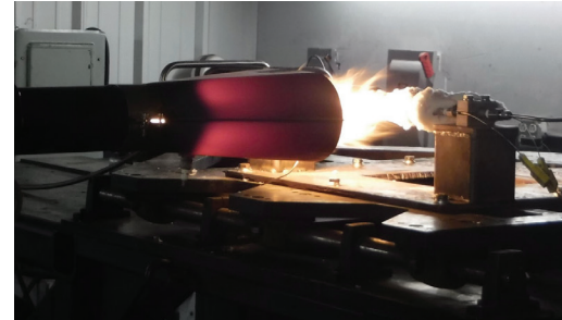
Outside Laboratory Fire Test in Progress