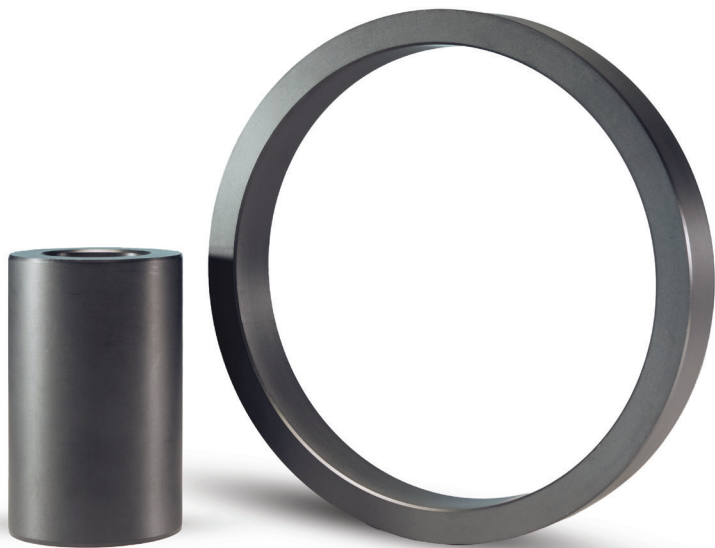
WR® 300 PEEK Composite

Having achieved success with pump components made of Greene Tweed's WR® 300 PEEK composite components at a fertilizer plant in India, the OEM had a deep understanding of its outstanding non-galling and non-seizing capabilities.